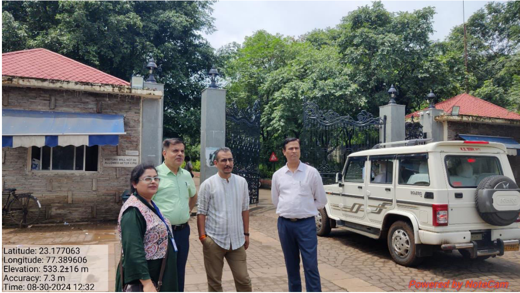
Jagran Lakecity University